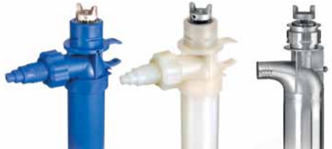
PF Series Drum Pump Tubes

Check out our other pump accessories at www.finishthompson.com/products/pump-accessories .