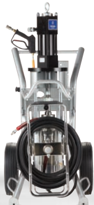
Hydra-Clean Hydraulic Cart-Mount*