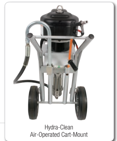
Hydra-Clean Air-Operated Cart-Mount