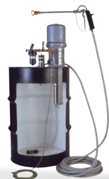
Hydra-Clean Air-Operated 10:1 Drum-Mount