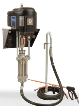
Hydra-Clean Air-Operated Wall-Mount