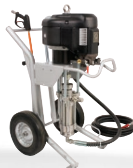
Hydra-Clean Air-Operated Cart-Mount