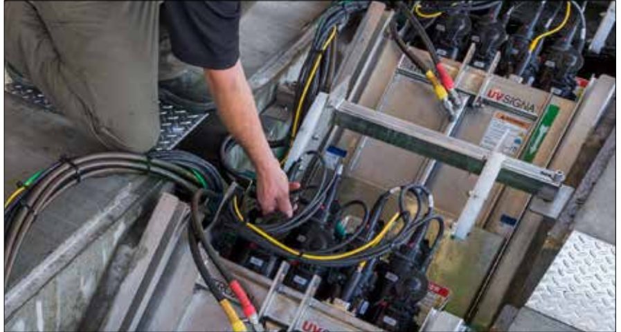
Routine maintenance is performed while banks are in the channel. However, when needed, banks can be raised by pressing a button and activating the ARM.